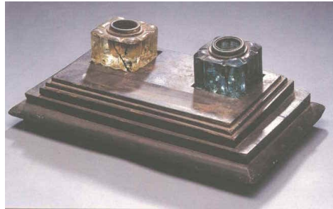
Ink Pot - Glass pots on wooden stand, early 20th century, High Court of Allahabad.

The Federal Court left behind a legacy of wisdom, independence and strength which the Supreme Court has maintained till today. The Supreme Court so far successfully played a key role in upholding the Constitution besides exercising necessary advisory jurisdiction. It has immensely contributed in upholding the rule of law and dispensing justice.