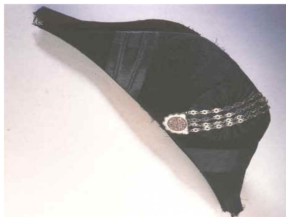
Cap of Privy Councillor , 1930-1947, High Court of Madhya Pradesh