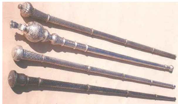
MACES - Silver, 19th Century, High Courts of Bombay, Andhra Pradesh, Karnataka and Calcutta

A rich treasure of archival materials having original records of landmark trials, judgment and other important documents and exhibits relating to judicial system have not been allowed access to the common people. Therefore, a need was felt to set up a Museum, where old photographs, documents relating to judgments of great importance, old furniture used by the Hon'ble Judges and other important artifacts etc. could be preserved and displayed for general public.