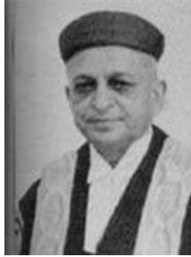
H.K. Kania First Chief Justice of India

The second gallery deals with the Federal Court and the Supreme Court. Here, antique furniture of Federal Court and Supreme Court are on display along with the souvenirs, ceremonial costumes and wigs and files related to land-mark judgments delivered by the Supreme Court. The records of famous cases such as Mahatma Gandhi Murder case and Indira Gandhi assassination case etc., are also on display. The old photographs of the Chief Justices and other Judges of the Federal Court and Supreme Court are specially mounted in a chronological order.